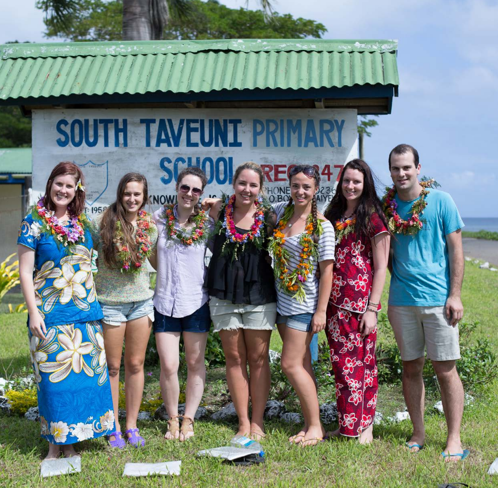
Deakin University Global Citizenship students in South Taveuni, Fiji